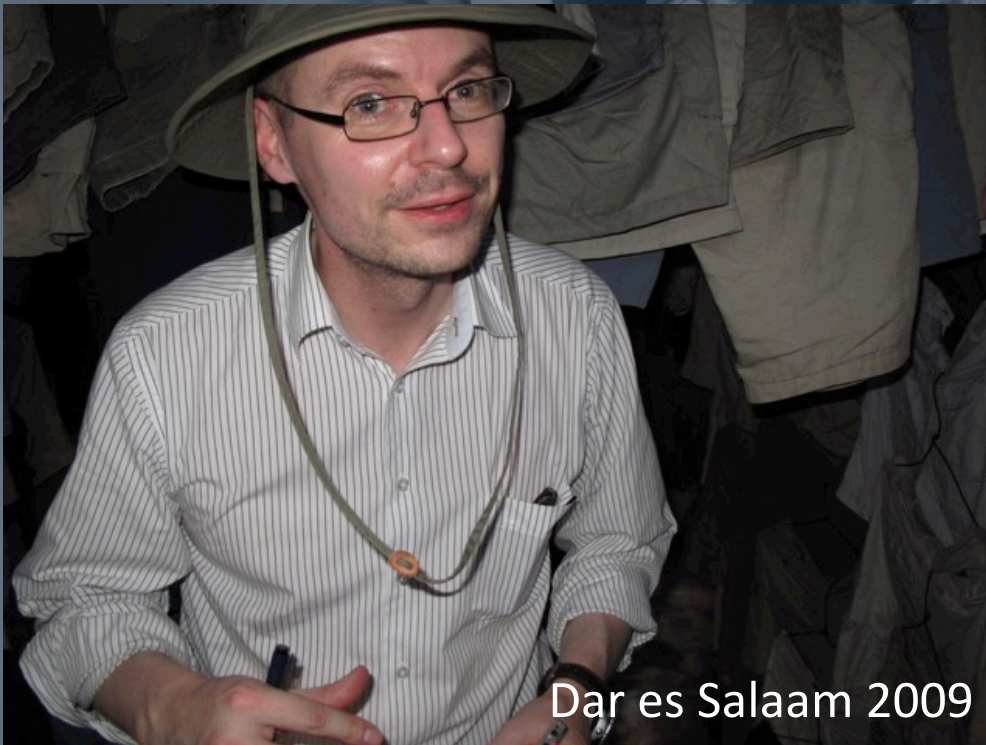
Dar es Salaam 2009